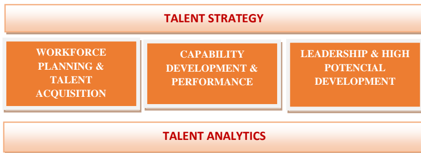
Figure 1 Practices of talent management